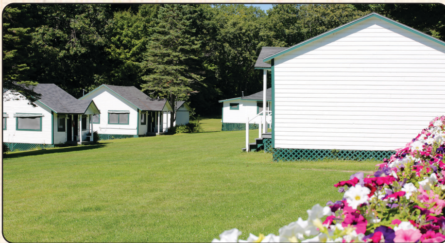
We're counting down the days until flowers are blooming at Kamp!

Please remember to look for lots of information and forms in your kohut.campintouch.com account and don't hesitate to reach out to us if you have any questions or concerns.