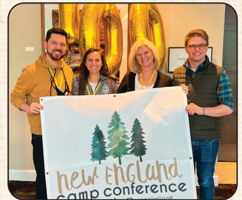
The Kohut Winter Team at the American Camp Association New England Conference!