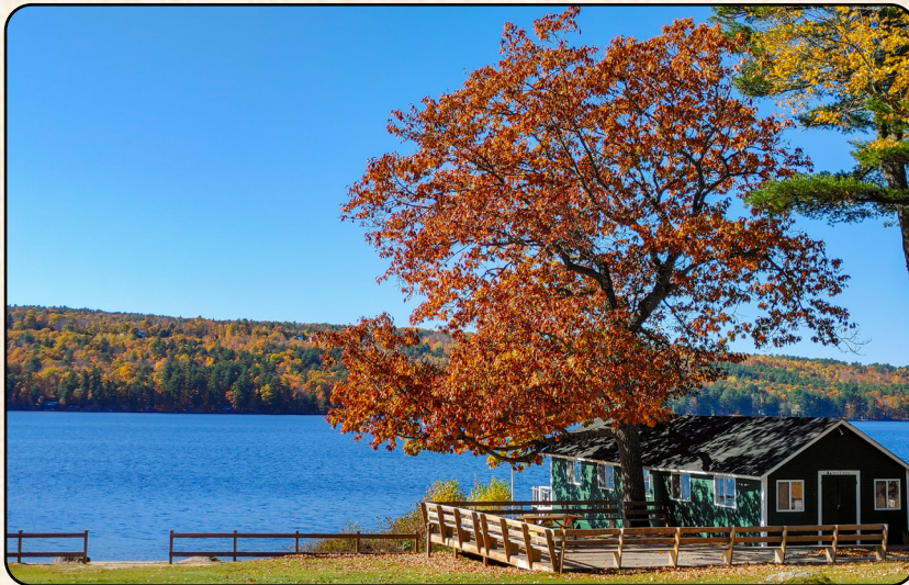
Kamp Kohut & Thompson Lake looking spectacular - October 29, 2021

Thanksgiving is the perfect time to thank all the parents, kampers, and staff who made Kamp happen last summer and over the past 29 years we have been owners/directors. We are truly grateful. Despite some COVID accommodations in 2021, we had a blast. It was incredibly nice to be together, outside, with friends, doing fun stuff, having an enriching Kohut experience. We missed our overseas family members, but as the international borders open, we can't wait to see you next summer. The planning has begun!!