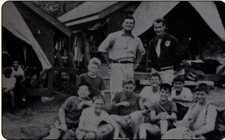
"Juniors Ready For Canoe Trip. Summer 1951

Excerpt from the Kamp Kohut Kronikle, Volume XLI, No. 7, August 24, 1951