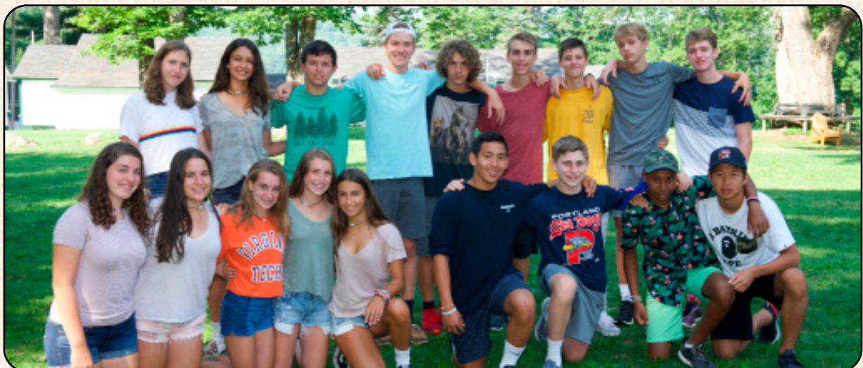
Second Session 2nd Year Seniors, Summer 2018