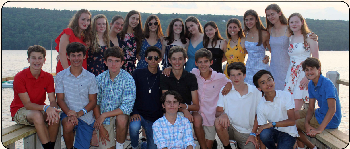
First Session 2nd Year Seniors, Summer 2018